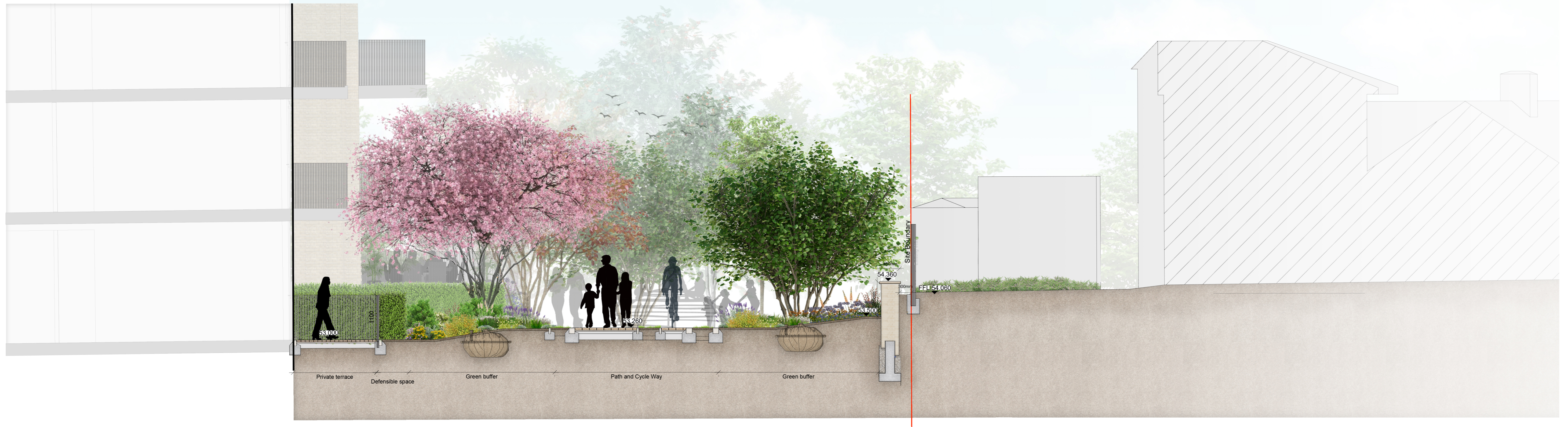
2 Landscape Section scale 1:50 @A0