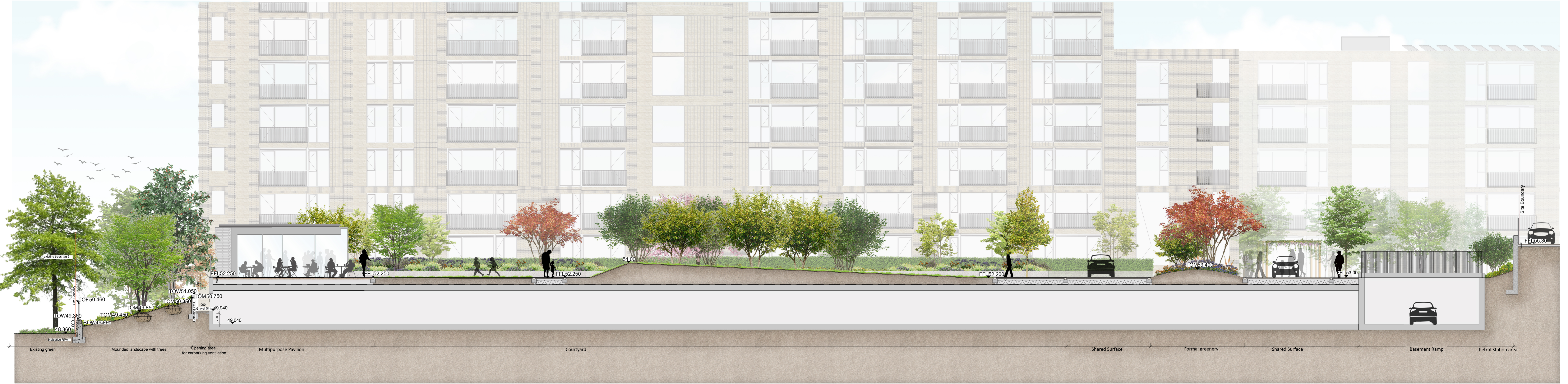
3 Landscape Elevation- Facing Block B scale 1:100 @A0

Cameo & Partners Cargo Works - ET 5.07 1-2 Hatfield, Watsons, London SE1 8PQ Company Registered No: 8756613 T: 0203 1760 130 E: info@cameoandpartners.com